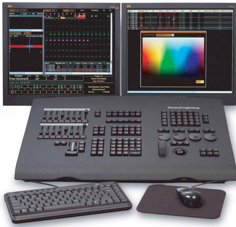
PaletteVL Lighting Control Console with 16 Submasters

Oh, and you can even read your existing Strand 300 and 500 series console show files, bringing new life to your repertory of productions.