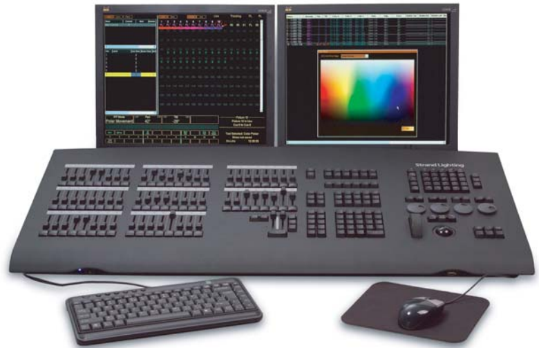
PaletteVL Lighting Control Console with 64 Submasters

Now you can have the power of conventional and moving light control in a value priced system. Palette VL features an integral trackball, moving light encoders and direct action attribute keys to extend the power of the Palette family of consoles. Available with 500 to 3000 channels, the new consoles now offer an optional second video display to present more information to console operators, including an advanced moving light control screen.