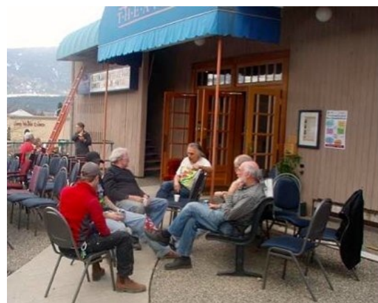
A well earned rest